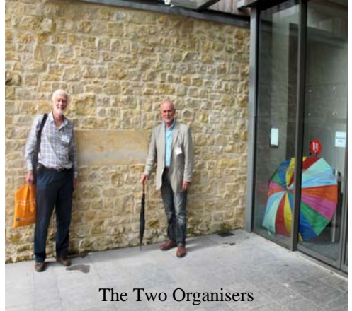
The Two Organisers

The adjudicators praised the high quality of the repertoire and the playing. Local trusts, businesses and private individuals supported the aim to give